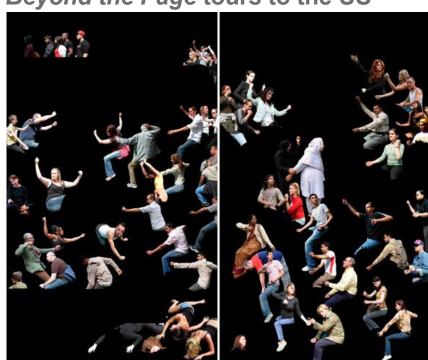
Battle Scenes , Lenticular Prints, 2006