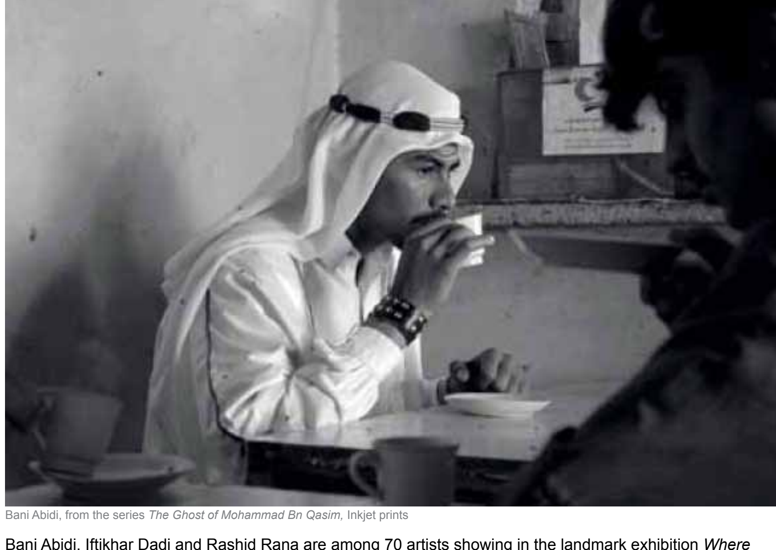
Bani Abidi, from the series The Ghost of Mohammad Bn Qasim , Inkjet prints

Bani Abidi, Iftikhar Dadi and Rashid Rana are among 70 artists showing in the landmark exhibition Where Three Dreams Cross: 150 years of Photography from India, Pakistan and Bangladesh organized by the Whitechapel Gallery, London.